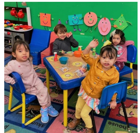
Pre-school snack time