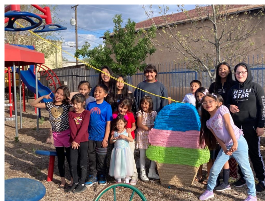
Pinata time on the ECM playground